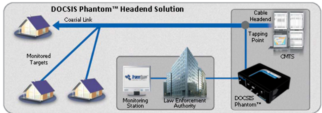
Cable Headend Solution