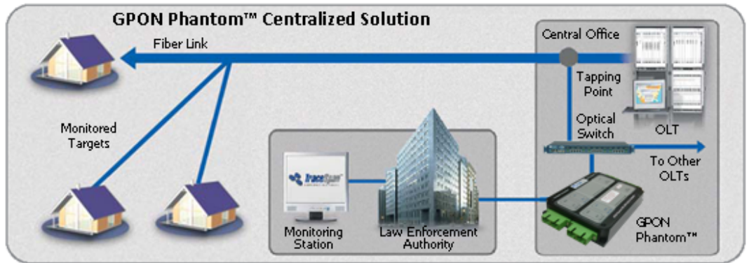
Centralized Solution – Monitoring of a Single Target or Multiple Targets